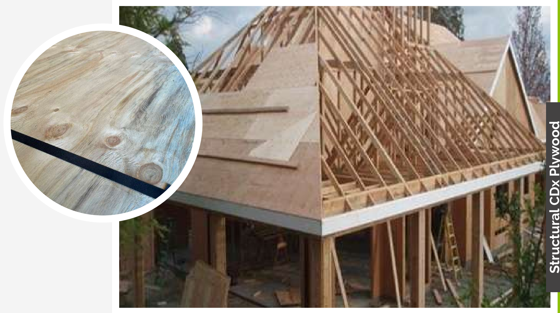
Structural CDx Plywood