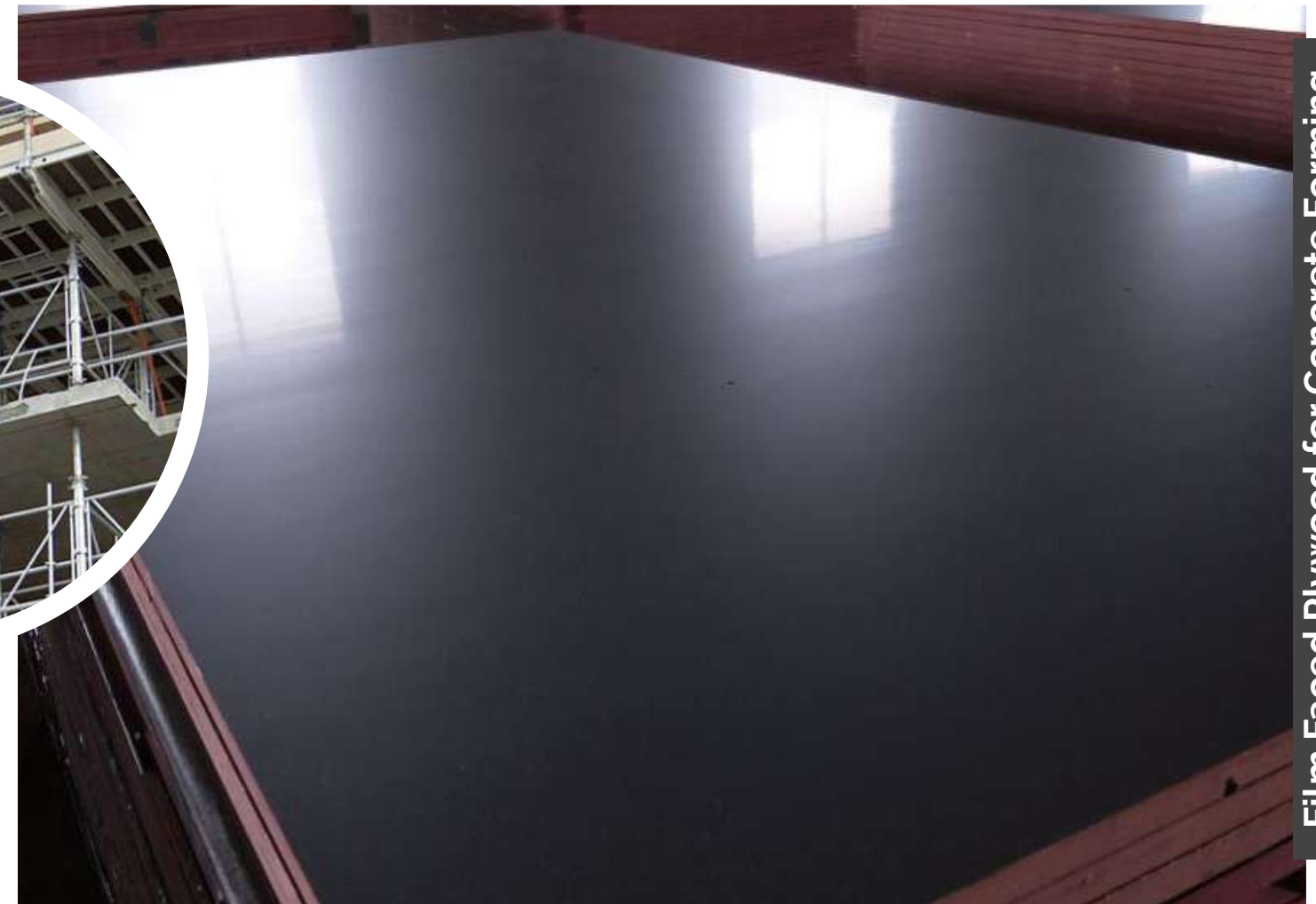
Film Faced Plywood for Concrete Forming